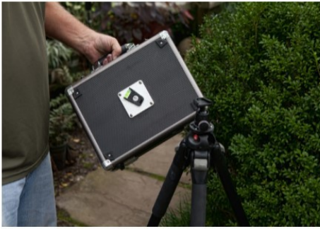
Here is the box with steel tripod plate ready to attach to your tripod, I use a quick couple for my own