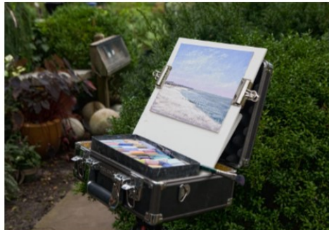
Finished Painting, Along the Bay 8x10