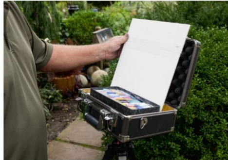
Folding support fully open, hold papers to 9x12