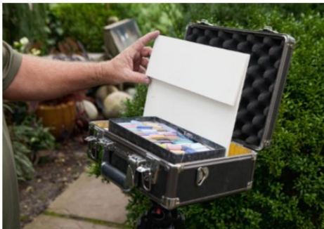
Open Box, set your pastel box on folding easel base open folding top (hint: I use the lid of my pastel box under folding panel for just the right height)