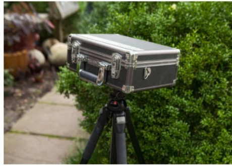
GOGH BOX mounted on your tripod (set on anything too)