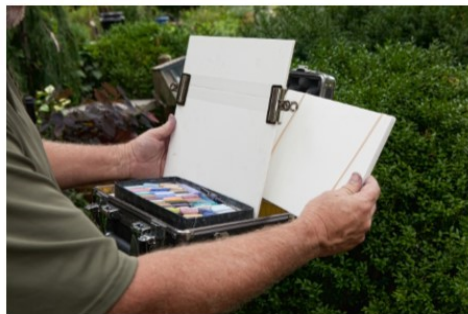
Foam Core sandwich holds paper and paintings safely for transit