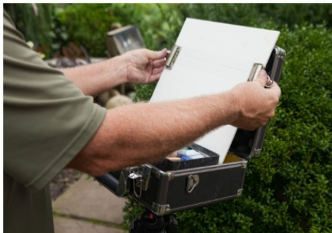
Bull Dog clips holds support stiff and hold your paper